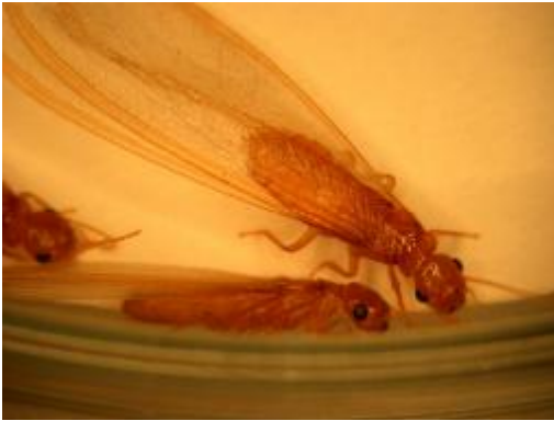
Figure 5. Winged reproductives or alates.

Mature colonies produce winged reproductive forms or alates at certain times of the year (Figure 5). The synchronised release of large numbers of alates, typically in early summer before a southerly change, sometimes results in the formation of huge swarms. These swarms produce an edible bounty for birds, lizards, insects and spiders. After the dispersal flight, the alates attempt to find mates and found new colonies.