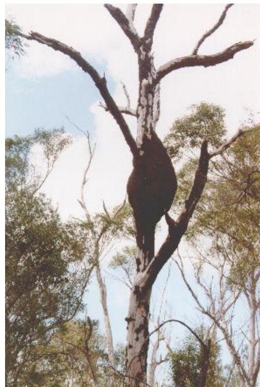
Figure 7. Arboreal nest of Nasutitermes walkeri .

Two species of subterranean termites, Coptotermes frenchi and C. acinaciformis , commonly inhabit living trees, the nests being inside the bole, often situated at ground level or above. Feeding is not confined to the centre of the nest tree, where a 'pipe' is formed but may extend through foraging galleries to other nearby trees, fences, poles or buildings. Whilst C. acinaciformis is the major termite pest throughout most of NSW, C. frenchi displaces it around Canberra and nearby tablelands. Sometimes nests are built on the branches of trees by Nasutitermes walkeri and Microcerotermes turneri and their tracks may spread over the tree (Figure 7).