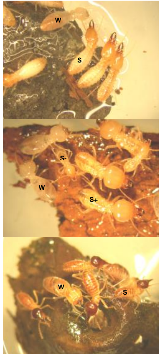
Figure 4. Termite soldier and workers Coptotermes acinaciformis (top), Schedorhinotermes intermedius (middle) and Nasutitermes walkeri (bottom). S=Soldier(+ major, - minor), W=worker.

Like the workers, soldiers are wingless, sterile and blind. When a termite trail is uncovered they are readily distinguished from workers by their pigmented heads. Soldiers may be 'mandibulate' with large prominent mandibles or 'nasute' with a pronounced snout and there may be more than one type of soldier in a single colony (Figure 4). The primary function of the soldiers is to defend the colony, usually against ants, which are their main enemies.