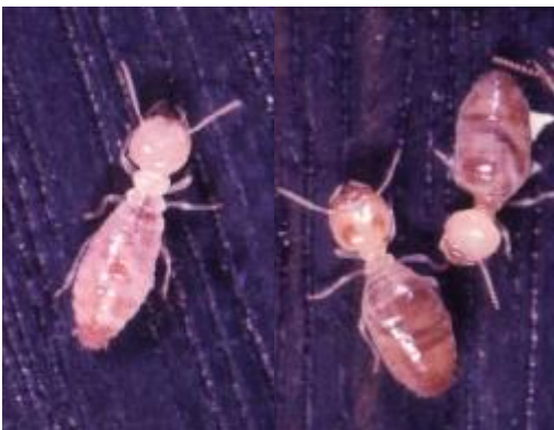
Figure 3. Worker termites Coptotermes (left) and Nasutitermes (right).

Worker termites are relatively uniform in appearance, regardless of species (Figure 3). In contrast, the head structure of soldier termites varies considerably. This variability has been used in the formal scientific classification of termites (taxonomy) into different related groups (e.g. genus, species). Some species, such as Schedorhinotermes intermedius , even have more than one form of soldier (Figure 4). The identification of the more common species based on the appearance of the heads of soldier termites is relatively straight forward and can be accomplished by anyone with access to the appropriate diagnostic keys and a quality hand lens or dissecting microscope.