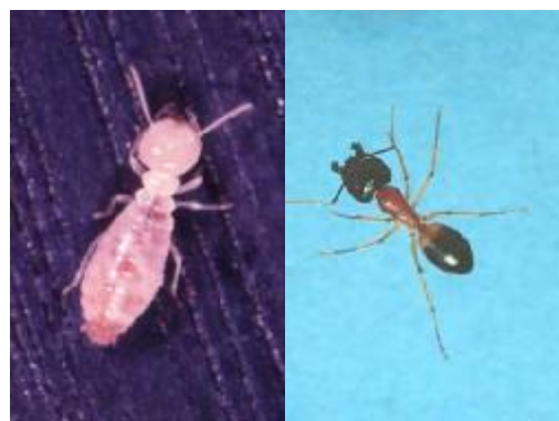
Figure 1. Worker termite and ant. Termites have straight or slightly curved, beadlike antennae, no eyes and no constriction between thorax and abdomen. Ants have markedly bent antennae, compound eyes, and a distinct 'waist'.

Termites are pallid, secretive creatures colloquially known as 'white ants'. Although termites and ants are very different types of insect, the confusion is understandable as they share some remarkable similarities. Both follow trails, live in nests or colonies in the ground, in timber and in trees and sometimes invade buildings. Nests are generally under the control of a single queen, and other members of the colony can have a range of specialised forms. Despite the similarities, termites differ from ants in a number of important ways (Figure 1). One major difference is that termites almost always remain hidden from view. Another is embodied in the name Isoptera, the insect group termites belong to. Isoptera (from the Greek Isos meaning the same, and ptera meaning wings) describes the paired wings of the reproductive caste, which are of equal size. In contrast the forewing of an ant is usually larger than the hind wing.