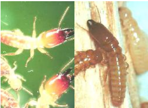
Figure 8. Dampwood termite soldiers. Porotermes (left) and Glyptotermes (right).

Dampwood termites have amongst the largest and ferocious looking soldiers to be found. Soldier termites from species of Porotermes , Stolotermes , Glyptotermes and Neotermes range in size over 10 mm and some species have large toothed mandibles (Figure 8).