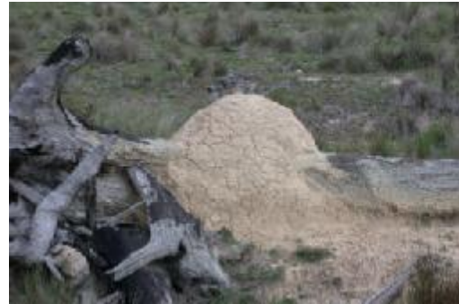
Figure 6. Mound nest of a subterranean termite.

Subterranean termites build their nests in the soil, in trees and other sheltered situations where a constant source of moisture is available. Nests are mostly around ground level. Many nests are started in or near dead tree stumps. Some nests are in the form of mounds, which extend both above and below ground level (Figure 6). In other